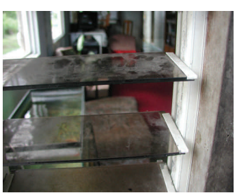
Dust on glass louvers

Human health effects include heart disorders e.g. irregular heartbeat, non-fatal heart attacks and aggravation of existing respiratory illness such as sinusitis, allergies and asthma.